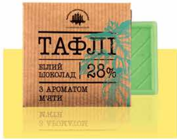
TABLETS WHITE CHOCOLATE WITH MINT AROMA