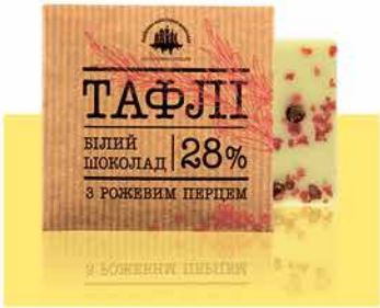
TABLETS WHITE CHOCOLATE WITH ROSE PEPPER