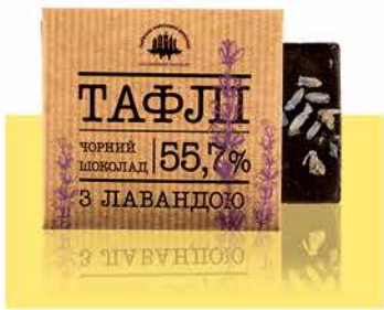
TABLETS DARK CHOCOLATE WITH LAVENDER