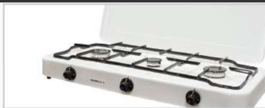
Gas hot plates