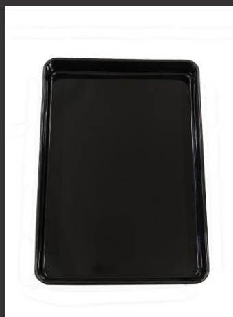
"House and garden"