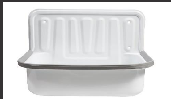
Washing basins / sinks