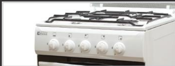
Freestanding gas cookers