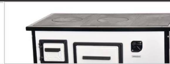
Cooking and heating stoves